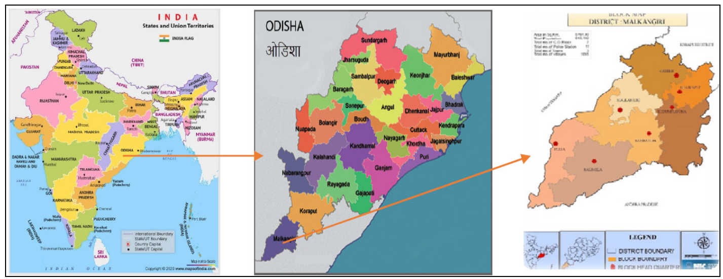
Fig. 1: Map of study area